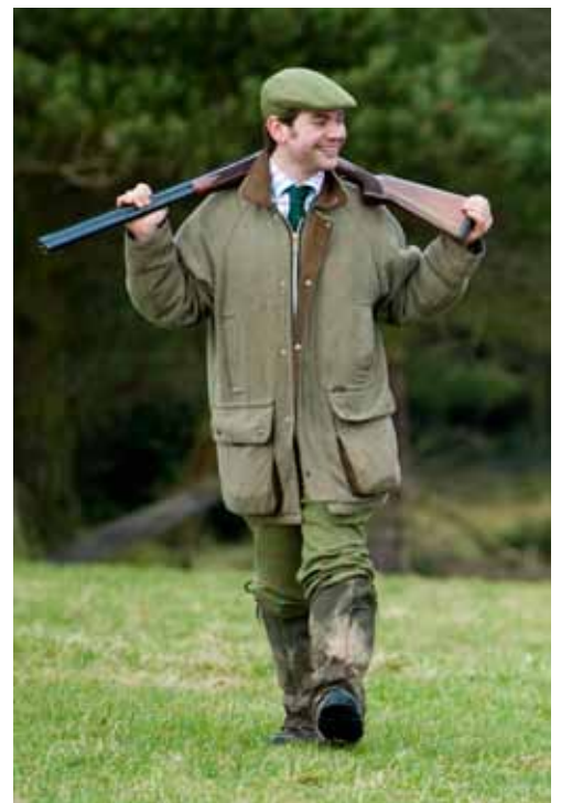
Looking rather happy anfter hunting down a DEFRA Policy maker and taking vengeance

Tomorrow I attend a work shop which explains how to fill out the latest paper chasing, form filling, non farming, and non income generating offering from DEFRA. The booklet in question is for us to record what happens with the soil on the farm throughout the year with a view to protect it from erosion and the like. Soil, to my knowledge was invented at least 100 years ago may be even more, (I googled an exact date but could not fine one, someone on a forum suggested it was a Thursday) and it has survived quiet happily up to now, I'm just looking out the window now to see if it is still there.... yes it is. DEFRA however do worry that if we don't look after the soil it could has devastating effects, badgers would have nowhere to live, ragwort (the poisonous yellow flowering plant the county councils love to grow on central reservations) would have no home and the reduction in the construction of new green field developments would spell disaster to mankind.