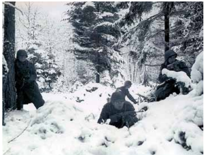
American Troops in defensive positions in Ardennes Forest Dec. 1944