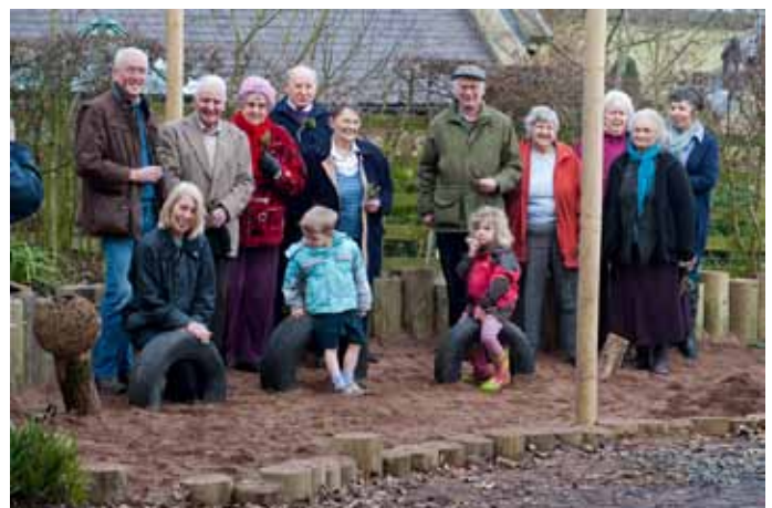
The villagers view the large scale Nessie formed at the Hall

The event was a wonderful finale to our explorations and investigations of Scottish Traditions, where we have designed and created our own tartans, constructed Loch Ness Monsters in all shapes forms and sizes, studied Highland Cattle, baked shortbread and identified places of personal significance to the children throughout Scotland and The Highlands. We are now jetting off to China for a wee peek at The Chinese New Year Celebrations.