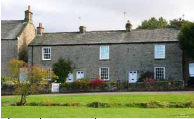
Elwy, Laburnum and Branton cottages at Branton

surroundings, new roads were built and new farming methods were introduced. For example, a new country house was built at Glanton Pike and planned farm buildings at South Farm. In the 18th and 19th centuries Glanton became an important stop on the coach road from London to Edinburgh. This brought such prosperity that much of the village was rebuilt in the late 18th and early 19th centuries and it served as a distribution centre for goods brought from Newcastle for over 50 years.