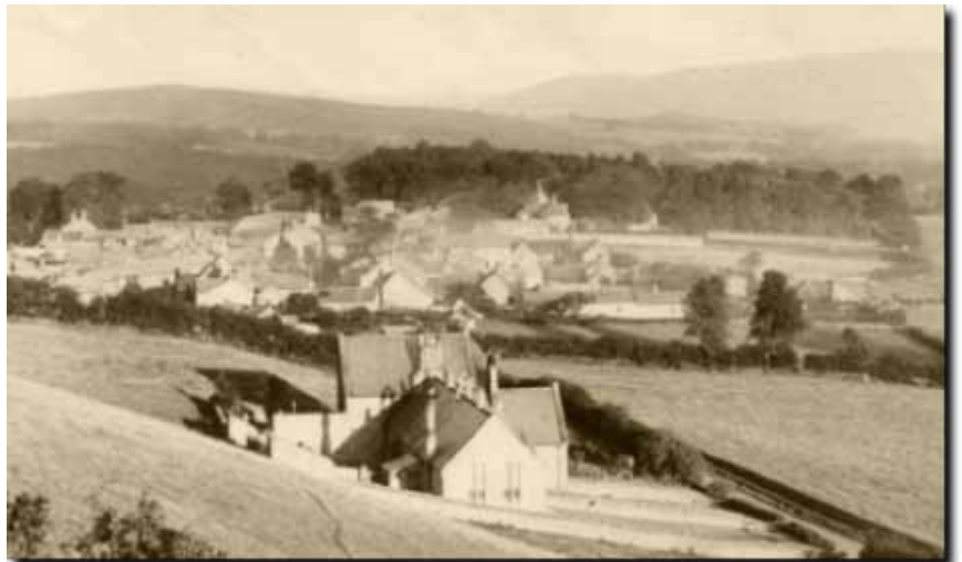
Glanton in the 1880s

There are two sites that may date to the Iron Age or Roman period. Both are on Glanton Hill. Aerial photographs show an enclosure and what may have been a small farm. The discovery of some querns, used for grinding grain, shows that crops must have been grown nearby. The Roman road called the Devil's Causeway also passes through the parish on its way northwards towards Berwick-upon-Tweed.